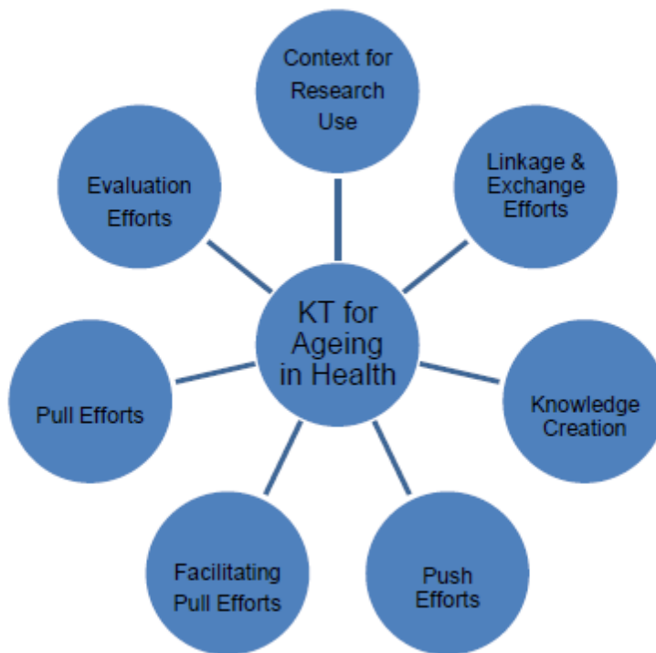
Figure 1. The seven key elements for knowledge translation (KT) on ageing and health (WHO 2012).

Different conceptual frameworks 1 have been developed to represent and explain how knowledge translation can, or does, occur (Best and Holmes 2010, Graham et al. 2006, Greenhalgh et al. 2004, Lavis et al. 2006, Moore et al. 2009, Redman et al. 2008, WHO 2012). It is worth noting, however, that these frameworks have not yet been tested empirically as a knowledge translation strategy. For the purpose of this overview, the WHO knowledge translation framework for health and ageing will be adopted to guide the overview (WHO 2012). This framework was developed from the linking research to practice framework (Lavis et al. 2006, Table 1) and is summarized in Figure 1 and Table 1. Further details regarding the framework can be found in the two main papers (Lavis et al. 2006, WHO 2012).